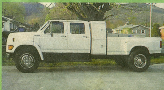
Ford F-800 Pickup Has Power To Spare