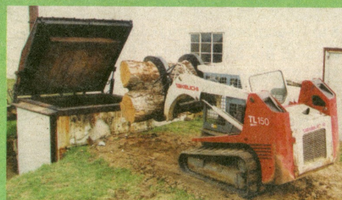
He Loads Wood Furnace With Skid Steer (Page 42)