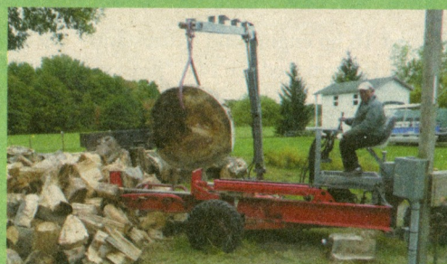
Giant Splitter Handles Huge Logs (Page 6)