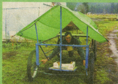
Buggy Makes Garden Work Easier