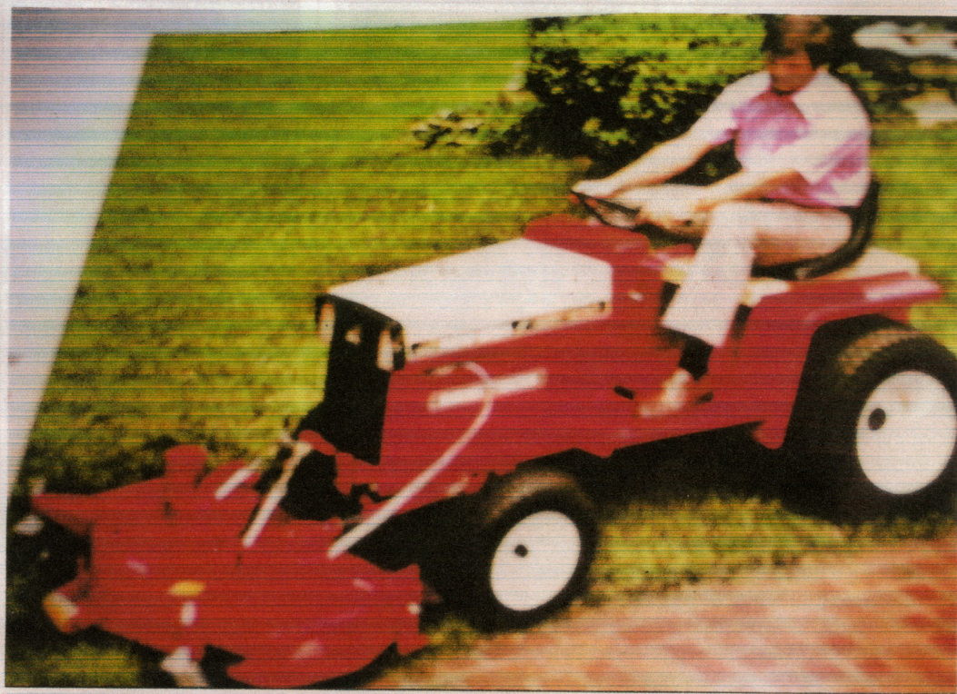
The AVCO New Idea Products EGT200.

powered machines, both based on modifications to its then-current product range. The smaller was a ride-on type based on the 'A' series known as the E81 with five forward and one reverse speeds, powering a fully floating 32in side discharge cutting deck.