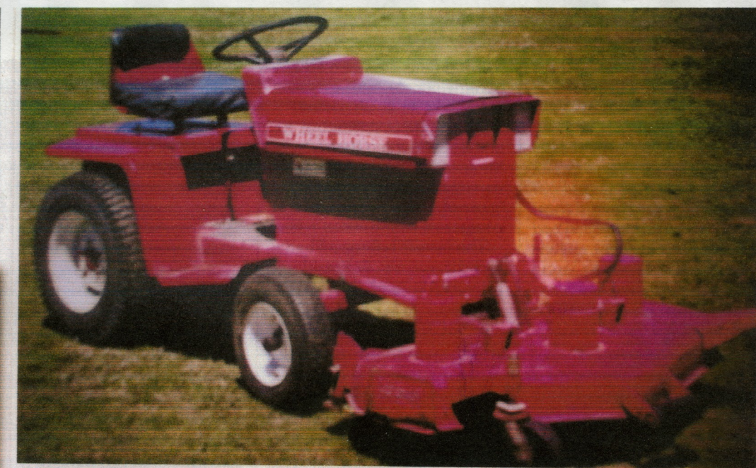
The Wheel-Horse B-145 tractor.

In 1980 Wheel-Horse produced two new electric