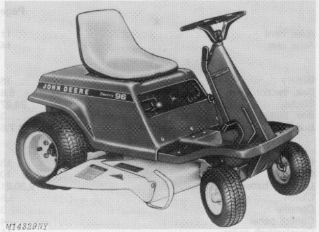
John Deere Electric 96 Mower 1975 Model (Serial No. 30001- )