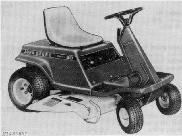
John Deere Electric 90 Mower 1972 Model (Serial No. 1001-10000) 1973 Model (Serial No. 10001-11704) 1974 Model (Serial No. 11705-13204)