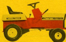
EGT-100 (10-hp Class) Electric Garden Tractor has 36" cut, "fuel" level gauge, extra big tires, lots of accessories.