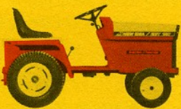
EGT-150 (16-hp Class) Electric Garden Tractor offers either 42" front- or mid-mounted mower, electric accessory lift, "Power Pulse" for extra surge of power.