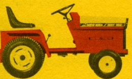
EGT-120 (14-hp Class) Electric Garden Tractor. Choice of 42" front- or mid-mounted mowers. Electric accessory and PTO outlets are standard.