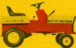
EGT-80 (8-hp Class) Electric Garden Tractor has 36" cut, full set of safety features, a variety of optional winter/summer work tools.