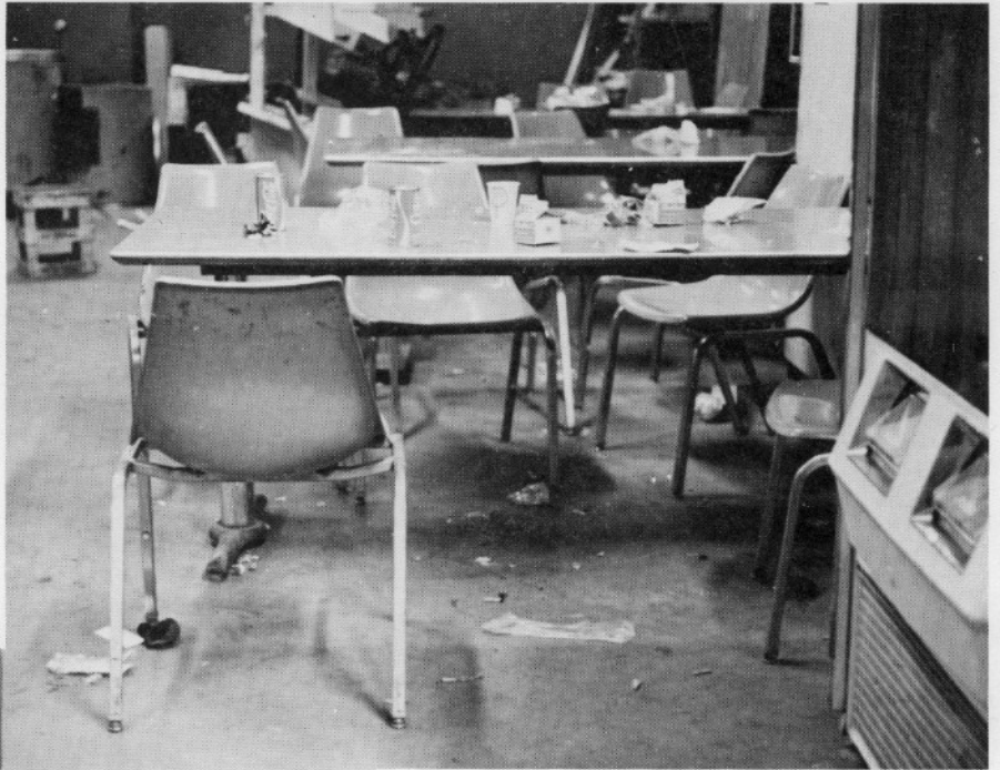
Bldg. 702 Cafeteria