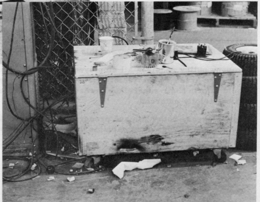
Bldg. 702 Assembly Area