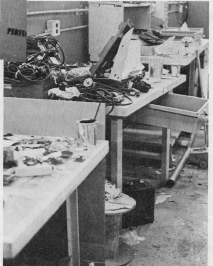
Bldg. 702 Repair Area