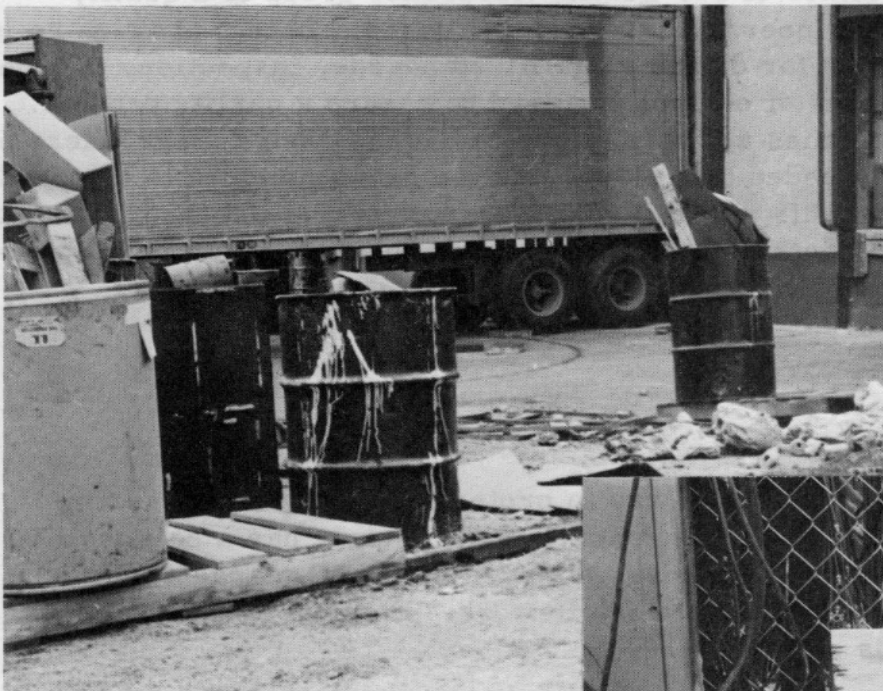
Bldg. 701 Loading Dock

If you are wondering why your area did not win the top award, the following photos may help answer your question.