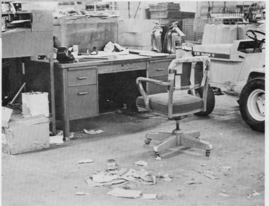
Bldg. 701 Foreman's Desk