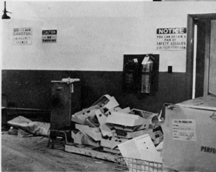
Bldg 702 Paint Area