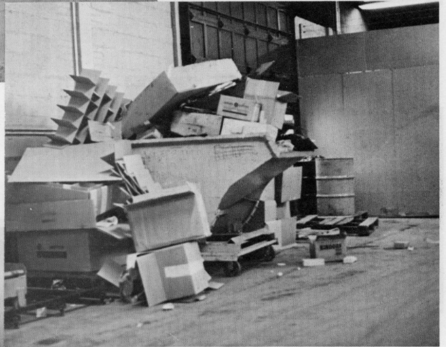
Bldg. 705 Paint Area Bldg. 701 Loading Dock