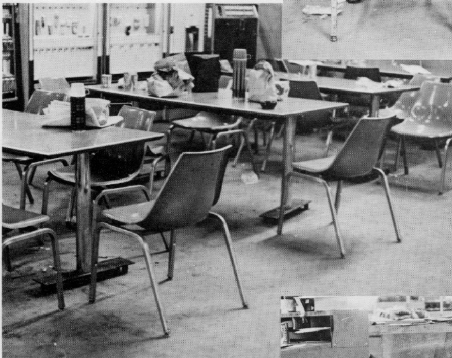
Bldg. 701 Cafeteria